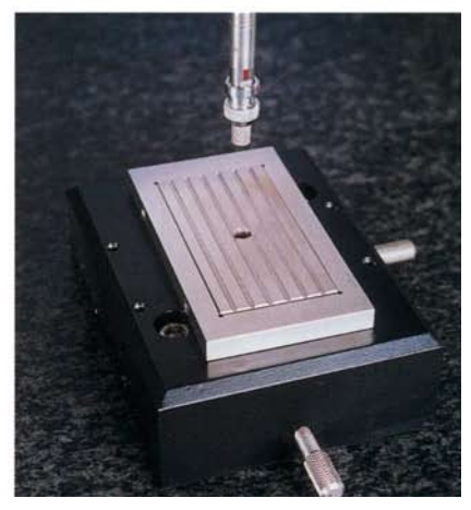
Your Precision Component