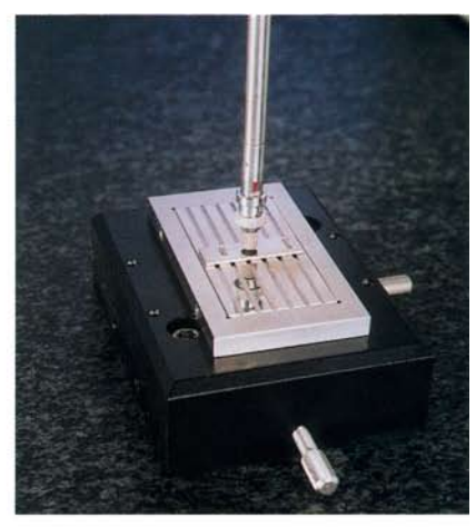
Thin Gage Blocks