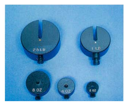
Force Kit (optional)