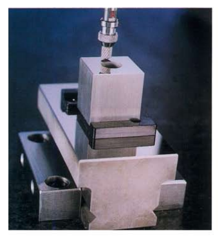
Square Gage Blocks