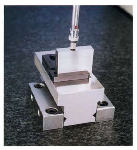
Rectangular Gage Blocks