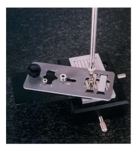
Rectangular Gage Blocks (Comparator Mode)